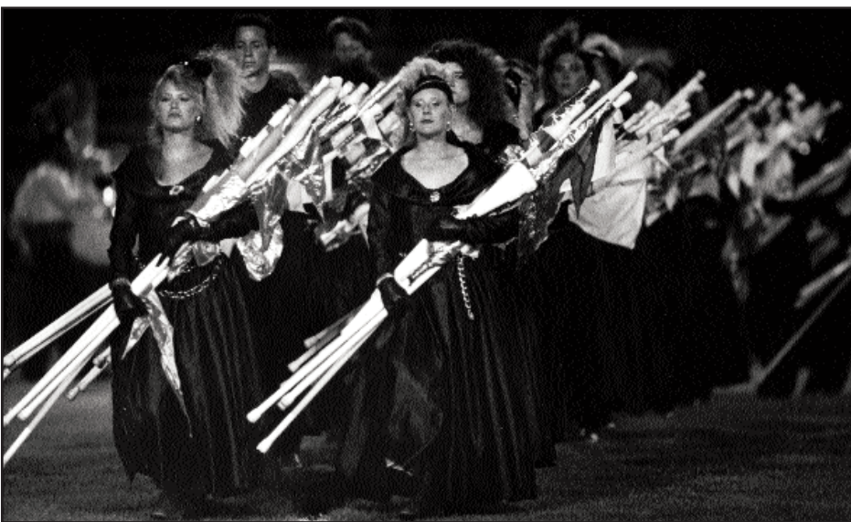
Sky Ryders, 1989 (photo by Orlin Wagner from the collection of Drum Corps World).

An abrupt change in musical style followed in 1989 when the corps switched to a cadet design for their uniform and played March From the Symphonic Metamorphosis and selections from "Carmina Burana." The new, darker direction wasn't popular with audiences or the judges and the corps