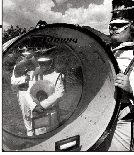
Sky Ryders, 1976 (photo by Orlin Wagner from the collection of Drum Corps World).