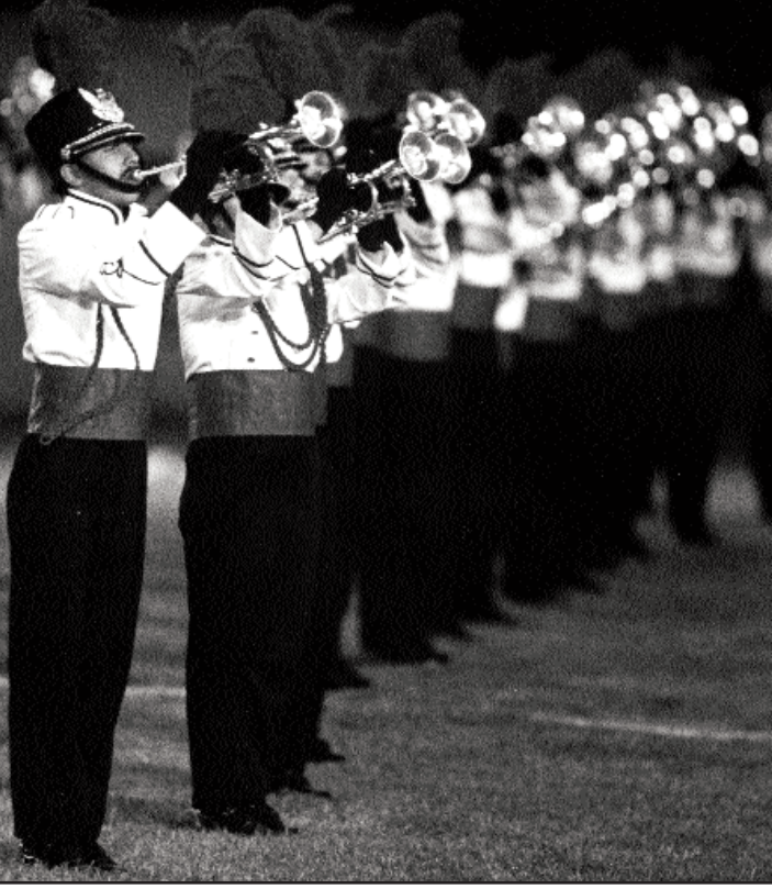
Sky Ryders, 1989 (photo by Orlin Wagner from the collection of Drum Corps World).

The DCI finishes in 1987 and 1988 placed the Sky Ryders in 12th and the three seasons