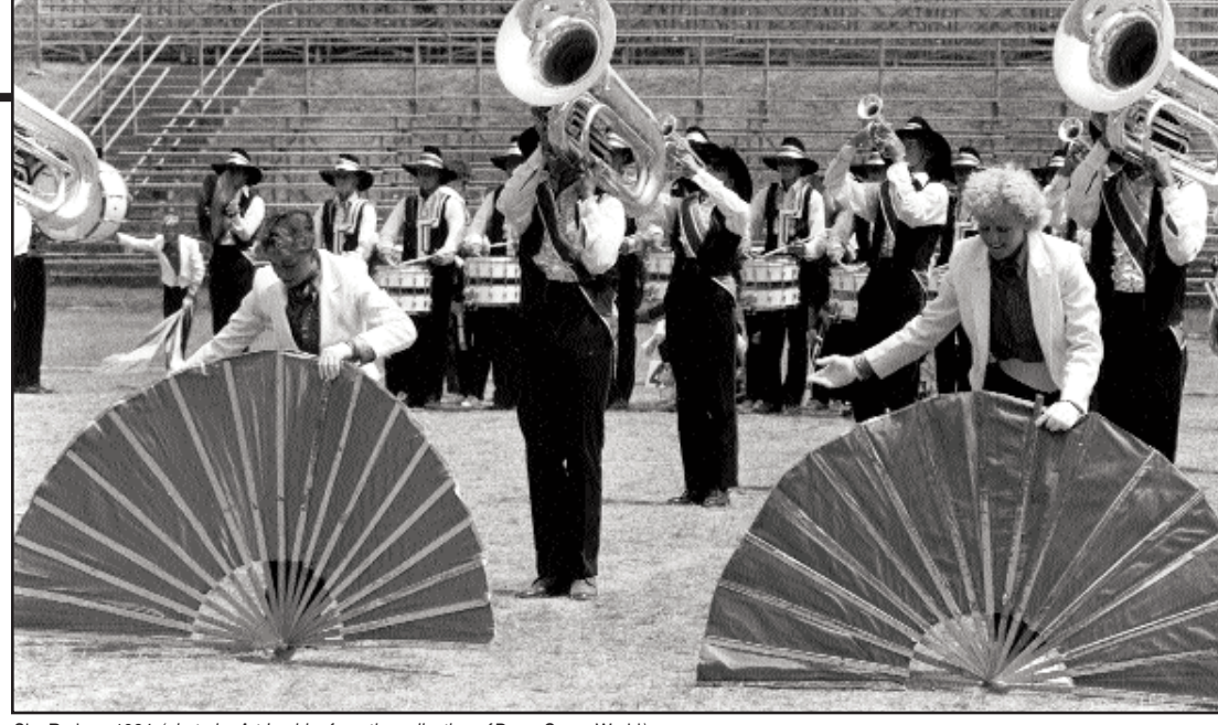
Sky Ryders, 1984 (photo by Art Luebke from the collection of Drum Corps World).

The 1966 season was a difficult one for the Sky Ryders. In fact, the corps almost folded