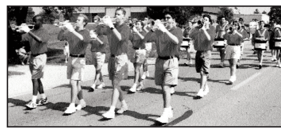
Sky Ryders, 1997 (photo by Roger Ellis from the collection of Drum Corps World).

The Sky Ryders transitioned from being a totally local drum and bugle corps to competing on the international stage. Like the Bridgemen, Velvet Knights and many others, they presented a particularly entertaining brand of music and visuals that stood out among the thousands of corps that have existed over the last eight decades.