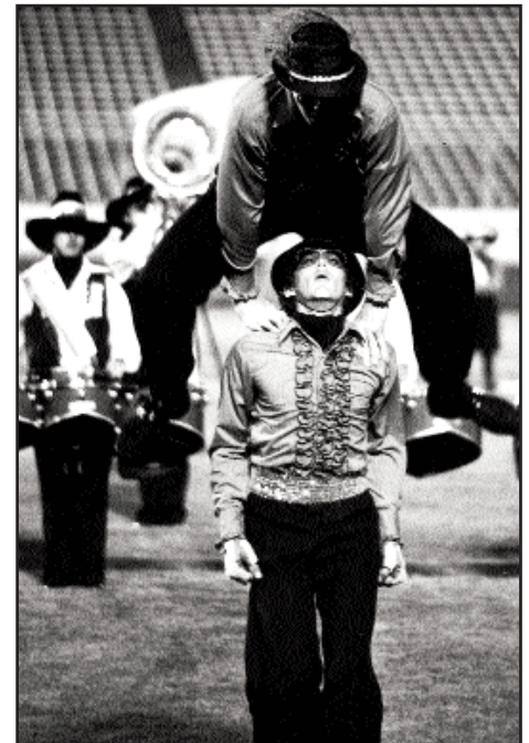
(Above) Sky Ryders, 1980 ; (left) Sky Ryders, 1982.

Starting in 1959, the corps began piling up honors. By winning the state American Legion contest, they traveled to the national convention in Minneapolis, MN, where they earned 10th place in finals, less than a point behind the Racine Kilties. The foundation of