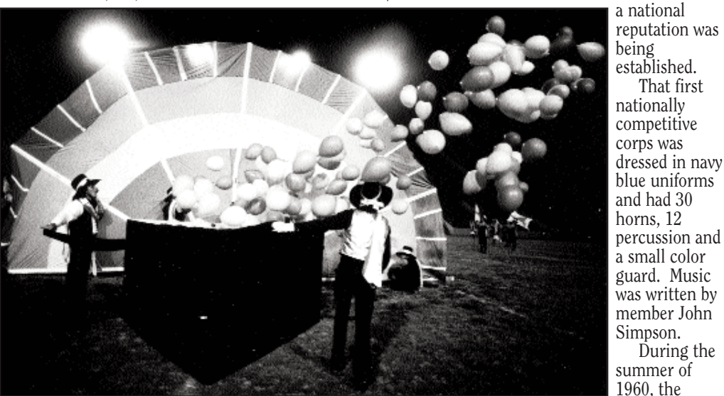
Sky Ryders, 1978.

Sky Ryders, 1984.